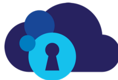
Figure 3: SafeCloud logo 3